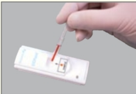
Figure 5: Transfer the blood sample into the sample port and wait 30 seconds