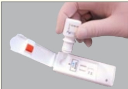
Figure 7: Add 5 drops of buffer into the buffer port and allow to run for 10 min