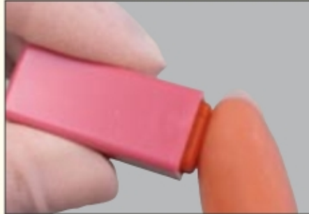
Figure 2: Place the lancet on the test site (lancet is not provided in the kit)