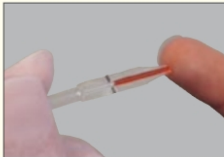
Figure 4: Collect the blood sample with the provided disposable pipette