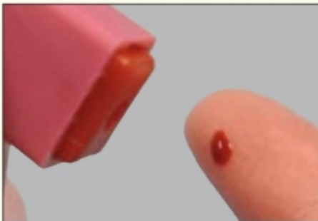
Figure 3: Push down the lancet to activate