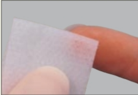
Figure 1: Clean test site with the pre-injection swab (not provided in the kit)

Before performing the test; Read and adhere strictly to the provided Instructions For Use