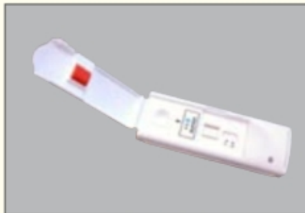
Figure 6: Lift the lid of the test device